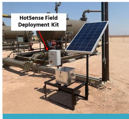
Figure 2: Field Deployment Kit installation