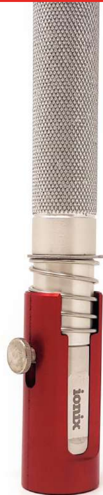
Couplant protector and handle