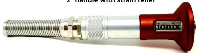
2" handle with strain relief