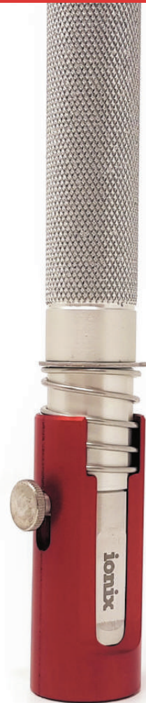
Couplant protector and handle