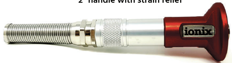
2" handle with strain relief