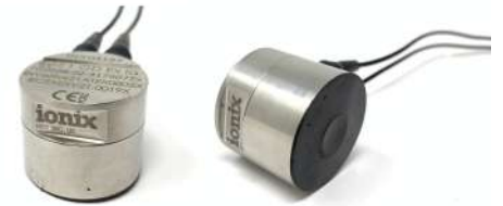
HotSense DE sensors with integrated magnetic mount and cables